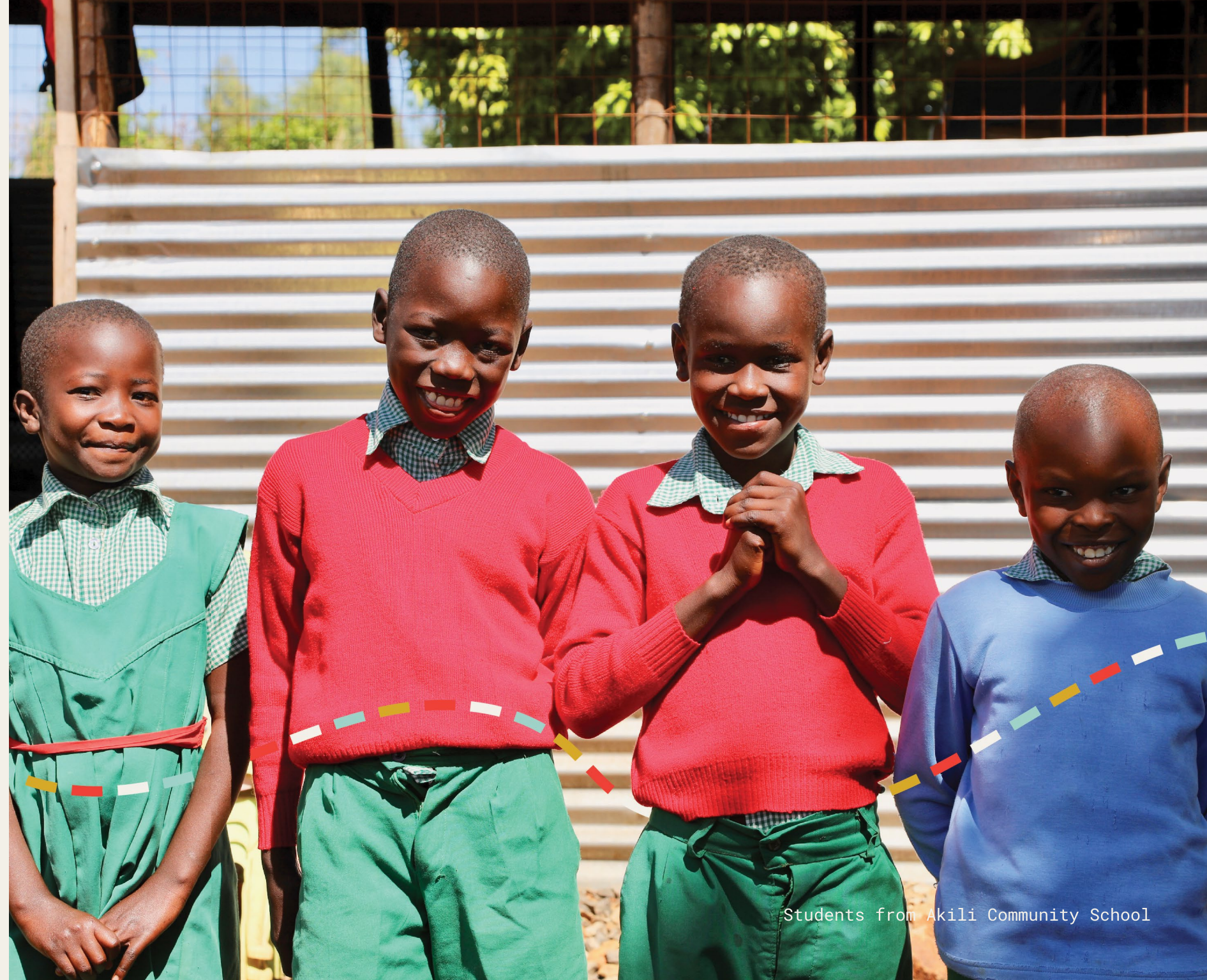
Students from Akili Community School

Riley Orton Foundation (ROF) is a grassroots NPO in Kisumu, Kenya. ROF envisions girls and a community with the agency to realize their full potential. Their mission is to alleviate generational poverty amongst the most disadvantaged and marginalized rural girls and families through the provision of holistic programming focused on education, health and wellness, economic empowerment, and life skills training. This provides rural girls and families with the agency to make sustainable changes for self-sufficiency.